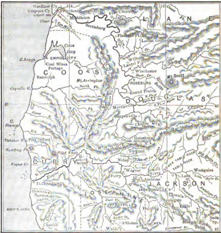
ROGUE RIVER AND UMPQUA VALLEYS.

Not a pack-train could move from point to point without a guard; not a settlement but was threatened. The stock of the farmers was being slaughtered nightly in some part of the valley; private dwellings were fortified, and no one could pass along the roads except at the peril of life. I might fill a volume with the movements of the white men during this war; the red men left no record of theirs.